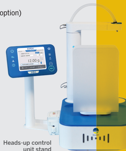
Heads-up control unit stand