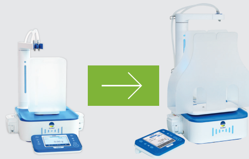
Tune-up your DILUMAT EXPERT EVO for large samples with the optional XL Pack