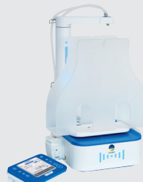
EXPERT EVO w/ XL pack